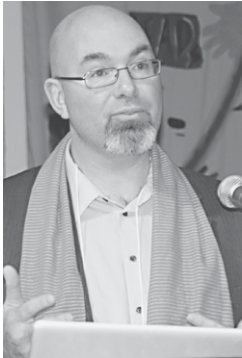
By Mike Denton Conference Minister

Reflections on conflict in election season lends insight into conflicts in the life of churches.