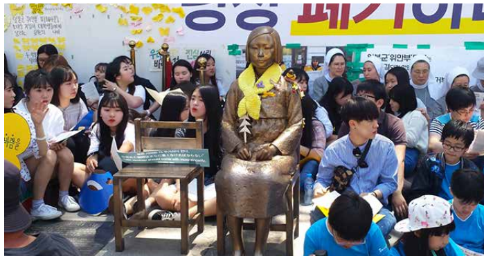
Wednesday protestors gather around "Pyeonghwabi" the Statue of Peace across from the Japanese Embassy in Seoul

The 2005 declaration came after Island residents put sufficient pressure on the Korean government to admit its role in a brutal suppression campaign in 1948 and 1949, in which more than 30,000 island residents were massacred by South Korean police and military forces in an unprecedented eradication campaign, apparently while American military forces there did nothing to in-