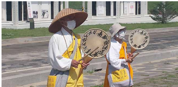
Japanese Buddhist monks praying for peace at the ruins of the Labor Party Building, Cheorwon, Korea.