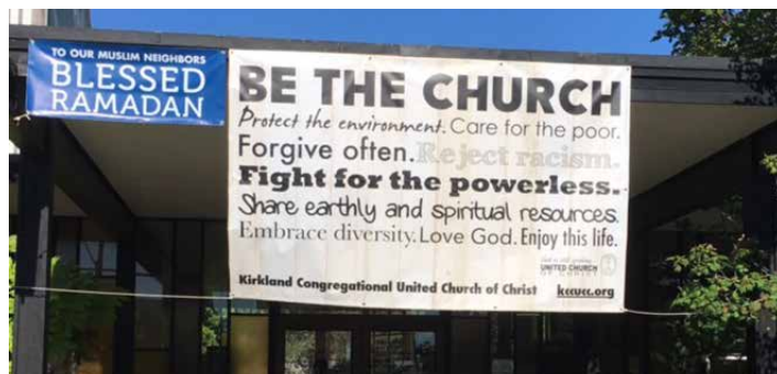
Kirkland UCC puts up banner.