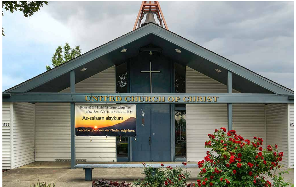
Veradale UCC sign includes the Arabic, "As-salaam alaykum" for "Peace be with you," and the word "peace" in 12 languages. "This is what our church should be doing," said a member.