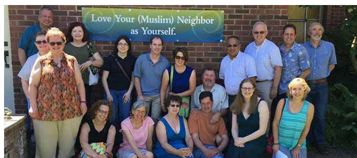
Broadview members put up banner.