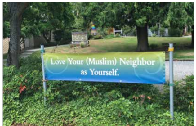
Richmond Beach Congregational UCC in Shoeline