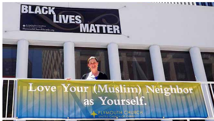
Plymouth Seattle displays banner.

For information, call 206-795-9475 or email clagett@