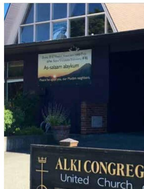
All Pilgrims Christian Church, Seattle, left. Westminster Congregational UCC, Spokane, center Alki Congregational UCC, Seattle, right