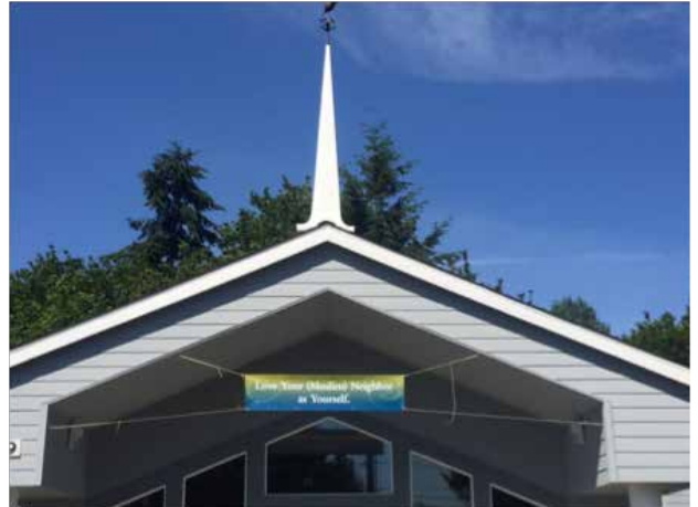
United Christian Church in Renton