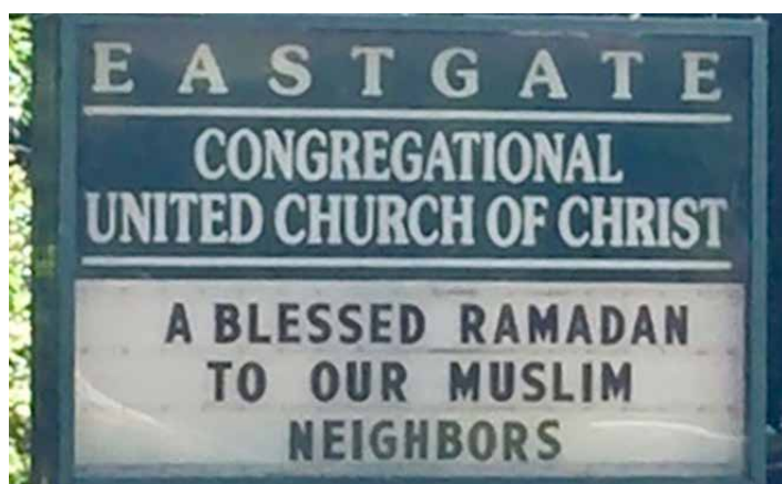
Eastgate UCC in Bellevue uses its signboard.