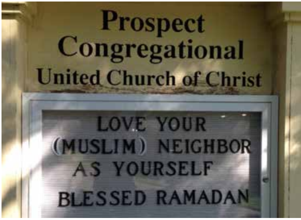
Prospect Congregational UCC in Seattle