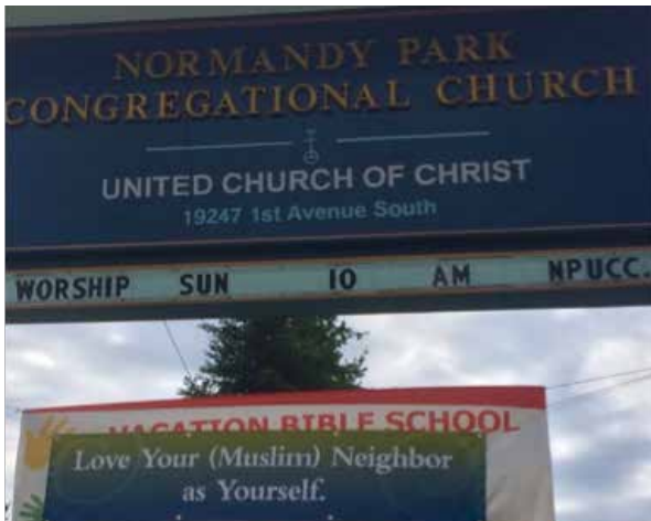
Normandy Park UCC in Seattle