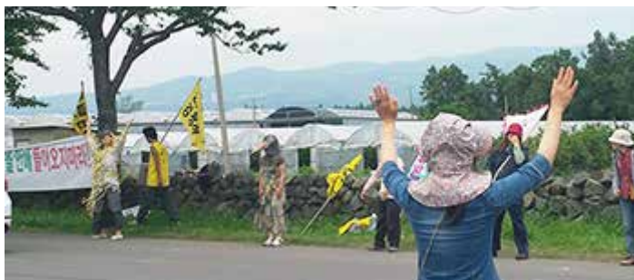
Anti-Naval Base protestors at Gangjeong Village, Jeju Island.