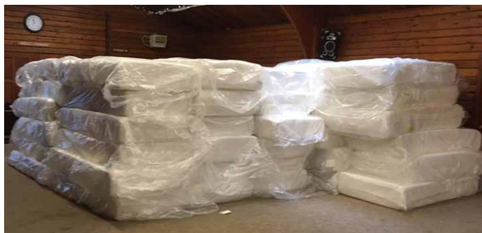
New mattresses piled in the lodge ready to be taken to the beds at Pilgrim Firs.