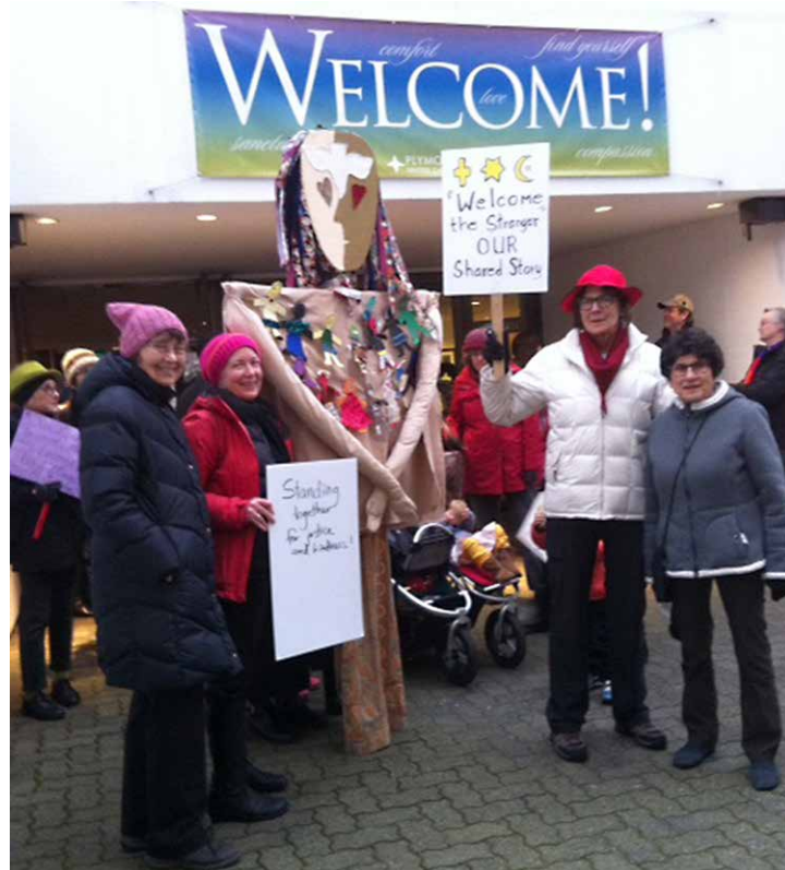
Justice and Witness Ministries called for rally for welcoming immigrants at Plymouth UCC in Seattle.

These are times that are calling the church to remember and live who Jesus is always