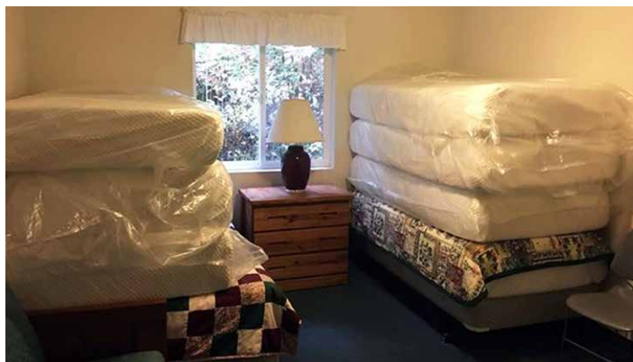
New mattresses are ready to go on beds at N-Sid-Sen.

the new mattresses will be in place there by summer. He is transporting mattresses.