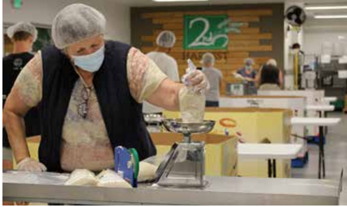
Volunteer packages food for Second Harvest to distribute.

Jason also contrasted distribution at the Mobile Markets, which supplement food banks and pantries. There were 359 mobile market events from Jan.