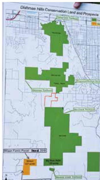
Map shows conservancy land.