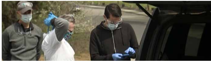
SNAP street medicine team goes to people where they are.

"As many homeless neighbors shelter in place under freeway overpasses, in vehicles, under tents or plastic tarps during this time without a reliable source of nutrition, this food provides not only vital calories, but also knowledge that the community