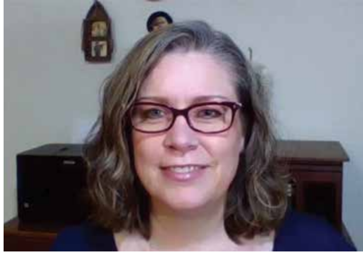
April May invites people to learn to speak on redistricting.

Follow-up coaching is also available, April said. People will