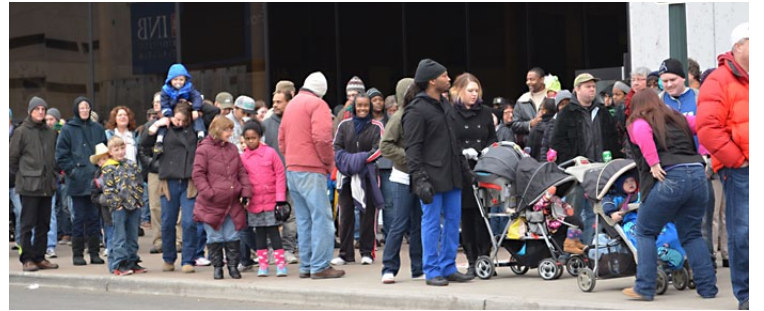
Marchers line up for Martin Luther King Jr. Day March that extended from the Convention Center to River Park Square.

“For whom will you sit at the table and speak? We are not called