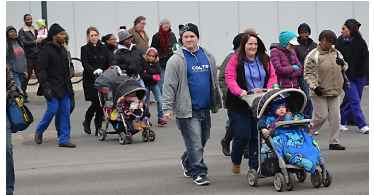
2014 march included many more children than previous years.

to fight every battle. You may fight the battle for homosexuals. Churches can’t escape that discussion. Someone else may build ramps in churches for people with disabilities. Someone may work on behalf of protecting children of immigrants here illegally. There are still homeless people, still children raising themselves under bridges. Who will sit at the table for them? We can’t afford any longer to be afraid,” she said.